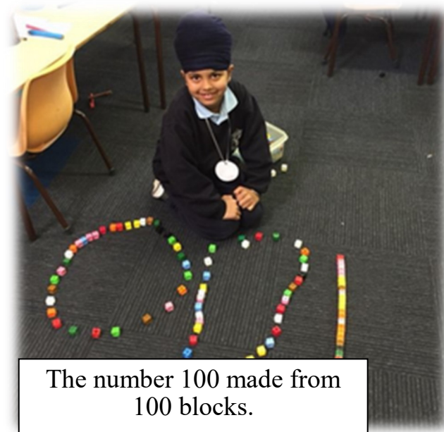
The number 100 made from 100 blocks.