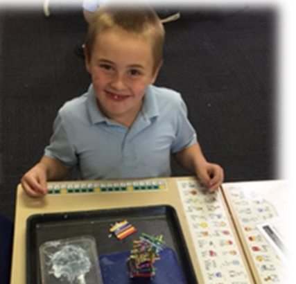
A tower made from 100 matchsticks.